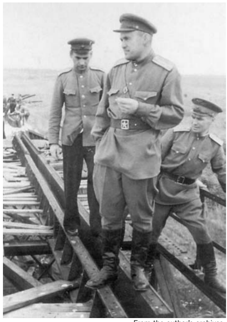
From the author's archives