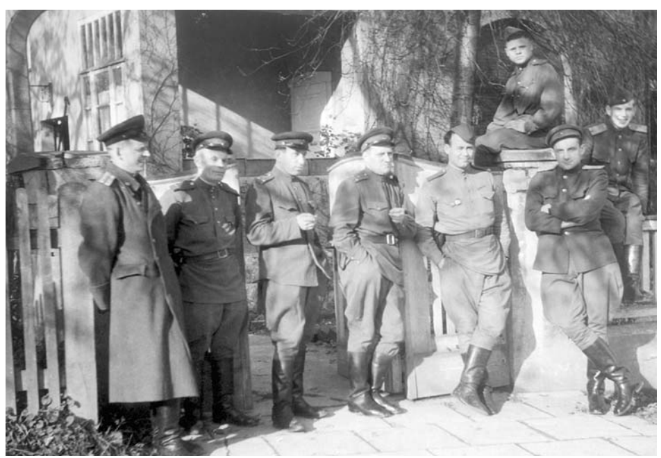
From the author's archives.