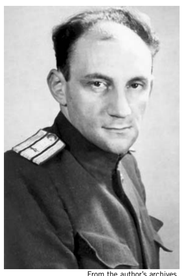
From the author's archive