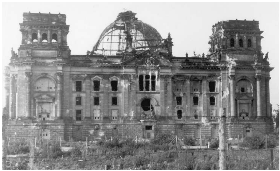
From the author's archives.

While we were at the Reichstag, very close by at the imperial chancellery the Nazi leaders were rejecting the demand for unconditional surrender. We didn't know this, of course, and when we were getting ready for the trip back to Buchow,