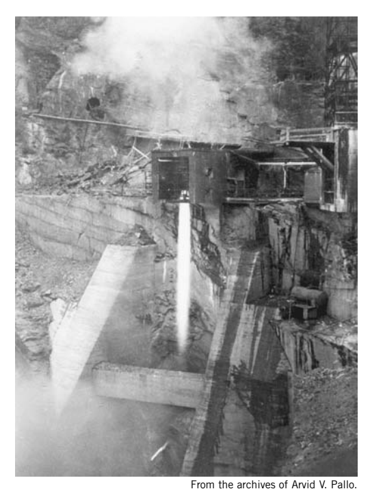
A-4 rocket firing tests in Lehesten, September 1945.

oxygen plant, and many other specialists whom the Americans had not deemed necessary to take into their zone.