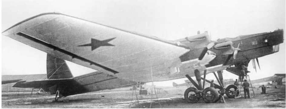
TB-3 (ANT-6) heavy bomber, 1933.

It seems to me that with the torrent of one new aviation achievement after another, much in aviation history has been undeservedly forgotten. In the 1930s, the Soviet Union attempted to create the most powerful strategic military air force, with the TB-3 heavy bomber as its foundation. Over a period of five years, the young aircraft industry produced more than 800 of these aircraft. This took place during a time of peace, which was also a time of hunger; the majority of the country's population was in acute need of foodstuffs and the most fundamental necessities of civilized life.