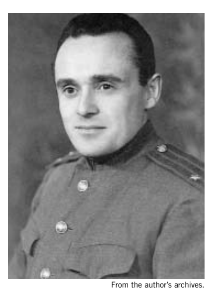
S.P. Korolev in Germany, November 1945.

Several days later, Korolev arrived in Bleicherode with the plenary powers to create the Vystrel (shot) group. The tasks of this new service included the study of missile pre-launch preparation equipment, ground-filling and launch equipment, and aiming equipment; flight mission calcula-