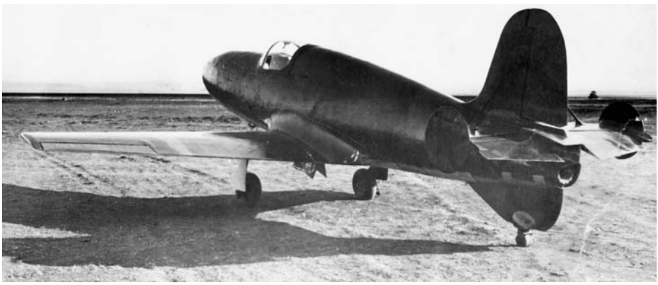
NASA History Office.

Later that evening, we all gathered for a celebration dinner at the spacious Air Force NII dining hall. Fedorov, Bolkhovitinov, and Pyshnov sat at the head of the table together with Bakhchivandzhi. Opening what was for those times a luxurious banquet, Fedorov congratulated Bolkhovitinov, Bakhchi, and all of us on our tremendous success. The results of all the flight recorders had already been processed. The entire flight had lasted 3 minutes 9 seconds. The aircraft had reached an altitude of 840 meters in 60 seconds with a maximum speed of 400 kilometers/hour and a maximum rate of climb of 23 meters/second.