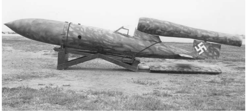
NASA History Office.

The Germans needed to set up the large-scale series production of the A-4. When Peenemünde was first being established, it was assumed that A-4 missiles