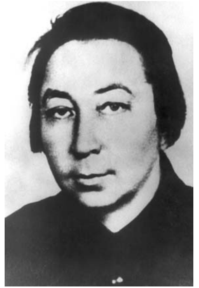
ZIKh museum archives.

Mitkevich began to make personnel changes in the Party leadership very quickly. New people arrived from the Central and Moscow Committee staffs and even from the Institute of