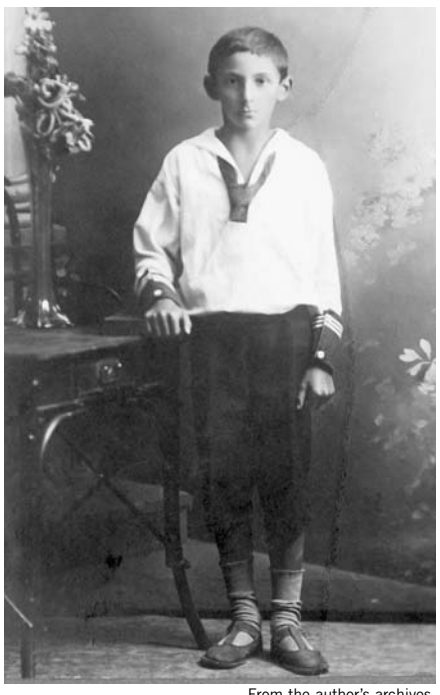
From the author's archives.

On New Year's Eve in 1919, these horses brought us, dozens of children, in sleighs to the first New Year's party in Russian history in the Hall of Columns of the Noblemen's Club. This was my first visit to the Hall of Columns of the future House of Unions. I have since been in that most popular old Muscovite hall innumerable times. Many visits to the Hall of Columns have been completely erased from my memory. But some of the events associated with it have been stamped in my memory forever.