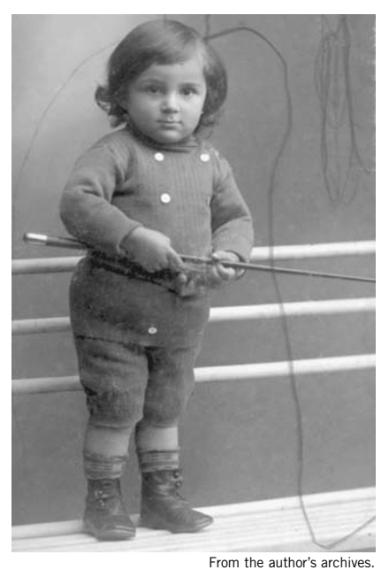
The author at the age of two in Lódz, Poland—1914.

shiny to some man, and he measured out something for her into a white bag—maybe flour, or groats.